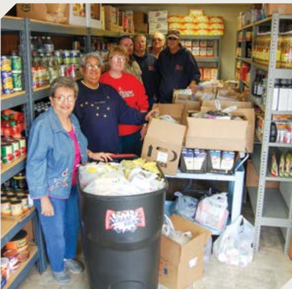
Wheatland's Tribune office delivers 820-pounds of food and $60 to the Greeley County Food Bank.

2014 total – 6,615 lbs. 2015 total – 7,081 lbs. Grand total – 13,696 lbs. about 7 TONS!