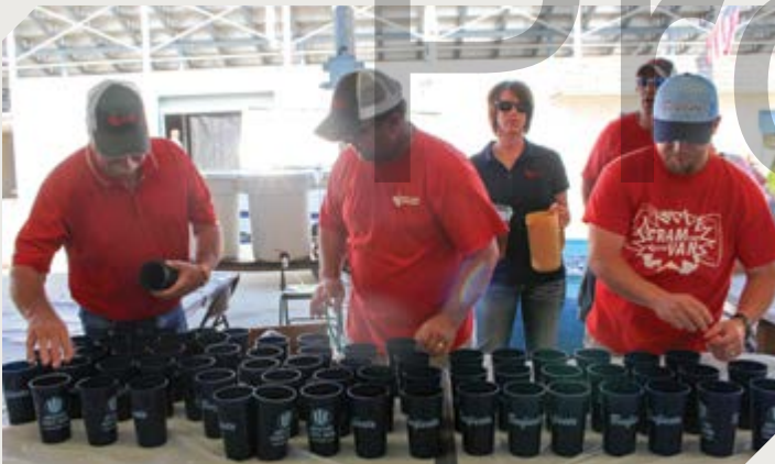
Wheatland employees line up endless rows of cups for iced tea to be served at the annual Beefiesta in Scott City.