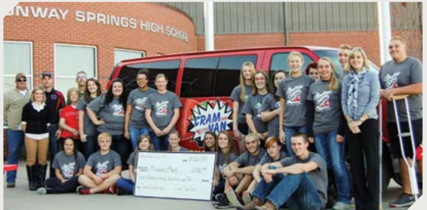
Wheatland and Conway Springs High School teamed up to collect 820 lbs. of food and $1,032.80 for their local food bank.