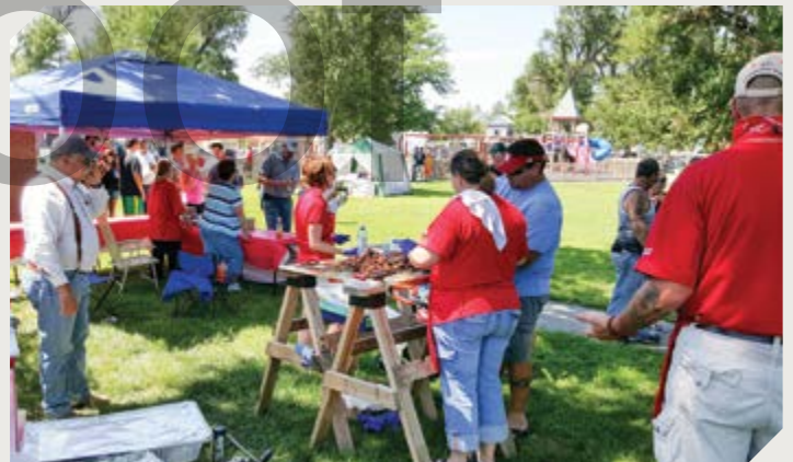
Wheatland employees and family members prepare thousands of tiny bite-sized pieces of steak for the annual Beef Tasting Booths in Scott City.